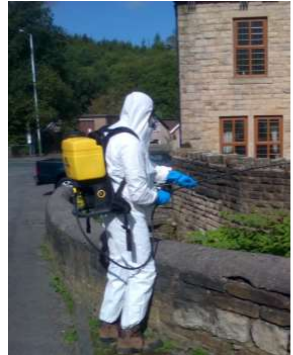
Environment Agency tackling Japanese Knotweed after Shawforth Flood Forum's first multi-agency meeting

Whitworth Flood Forum 'going live' after successful multi-agency meeting (Article: Whitworth Valley News)