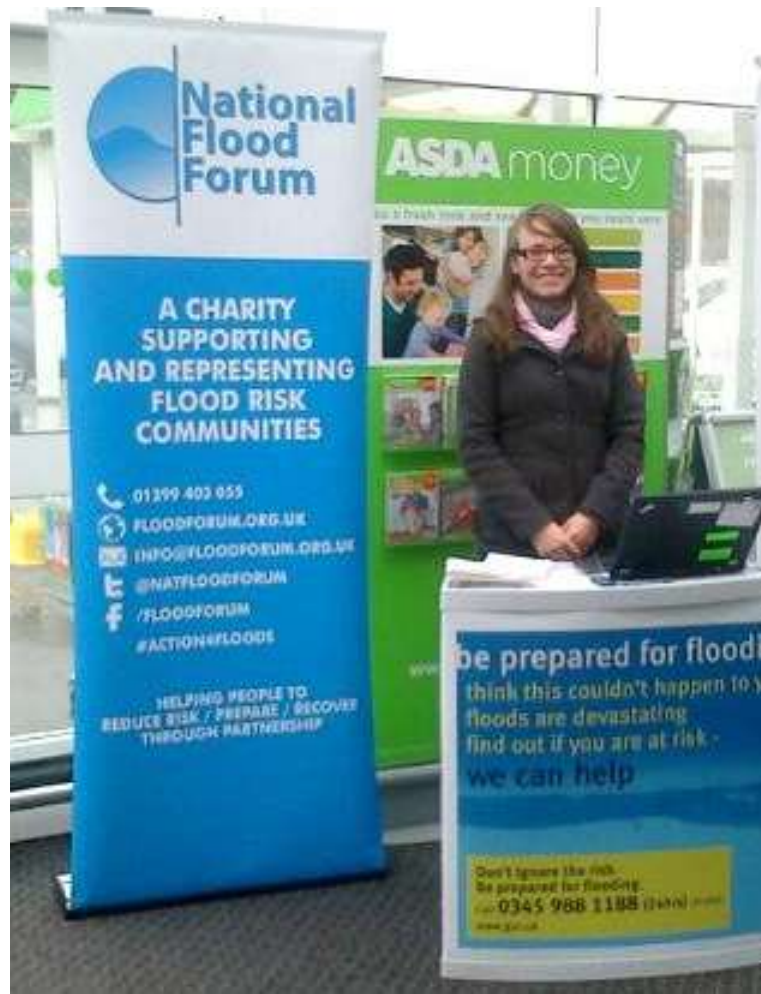
National Flood Forum raising awareness with Environment Agency in Rawtenstall

Example invitation sent to all those at flood risk in Waterfoot (Invitation: National Flood Forum)