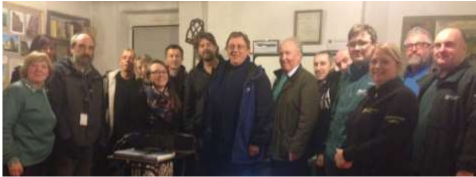
Rawtenstall Flood Forum's First Multi-Agency Meeting