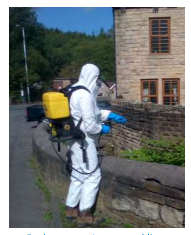
Environment Agency tackling Japanese Knotweed after Shawforth Flood Forum's first multi-agency meeting

Whitworth Flood Forum 'going live' after successful multiagency meeting (Article: Whitworth Valley News)